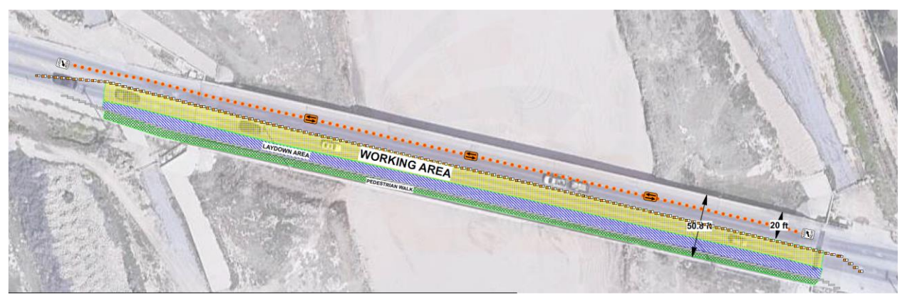
Phase 2: Current Temporary Traffic Lanes at North