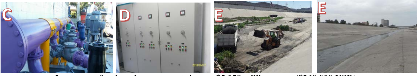
Investment for these improvements is over $5.058 million pesos ($260,000 USD).

Additional personnel were contracted to continuously monitor operations of PB-CILA.