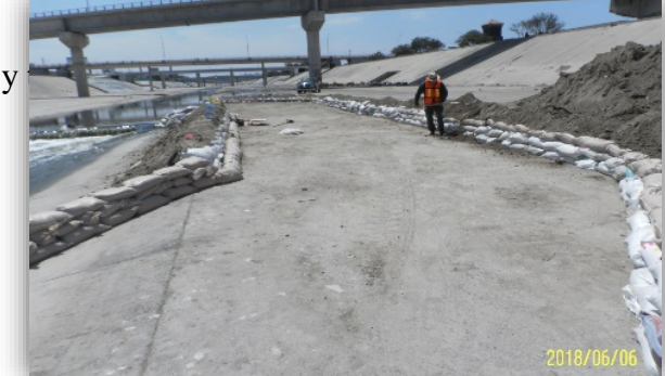
Construction of the sandbag weir in the Tijuana River channel in Mexico.

CESPT continues to carry out rehabilitation works in the emerging wastewater collectors in Tijuana, among which are the Insurgentes, Oriente, INV and San Martín-Cañón del Sainz collectors. Likewise, CESPT will join resources with CONAGUA, NADB and USEPA for the rehabilitation of more than 5 kilometers of the "Poniente" wastewater collector, for a total investment of $47.5 million pesos ($ 2.3 million USD).