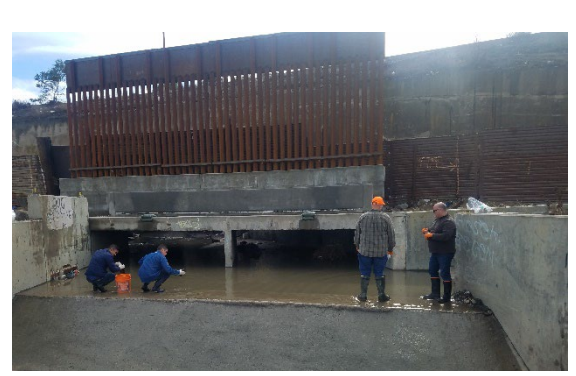
Photos: December 2018, water quality sample collection as part of the IBWC Tijuana River and Canyons binational study.